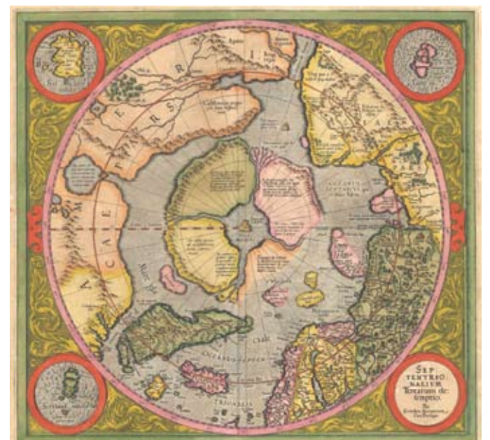
The Mercator map of the North Pole, with rivers running into the earth's core at the Pole, from the late 16th century.