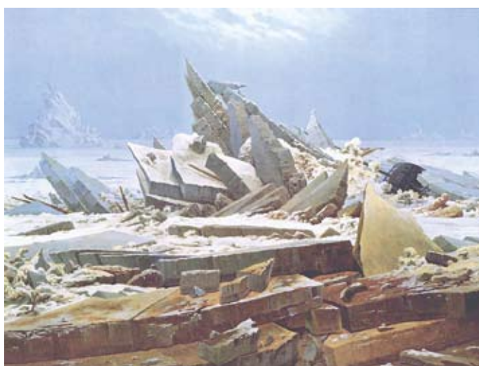
Many attempts at navigating the Northwest Passage ended in disaster. Polar Sea by Caspar David Friedrich, 1774-1840.